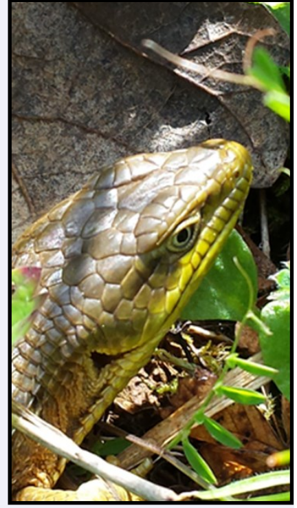
Alligator Lizard