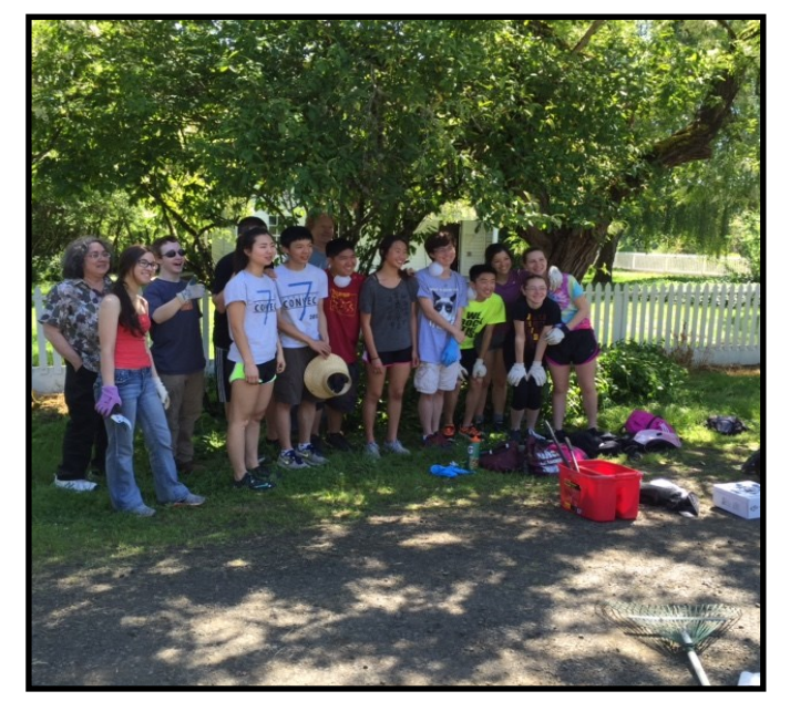
Some of the volunteers at the William L. Finley clean-up event on May 7th

Cleaning up an overgrown native garden