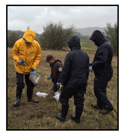
Bulb planting at Baskett Slough Refuge

Lastly, thank you all for being part of our organization and for your help. Without you, this organization could not endure. Your membership and donations have provided our organization with the funds to assist our refuges in many activities, such as protecting threatened and endangered species, removal of invasive species and encouraging our children to enjoy the outdoors. Thank you again.