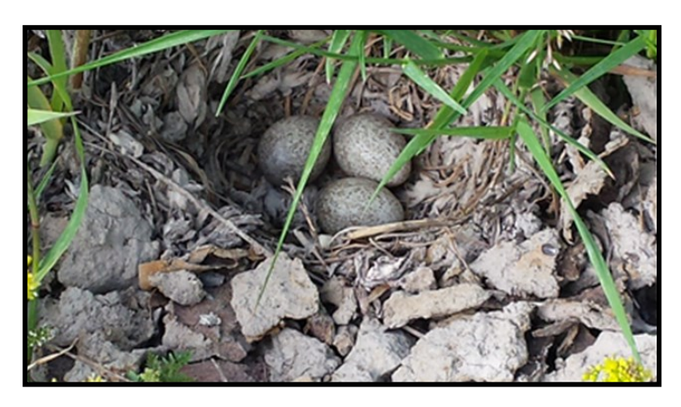
Streaked horned lark nest (M. Monroe)