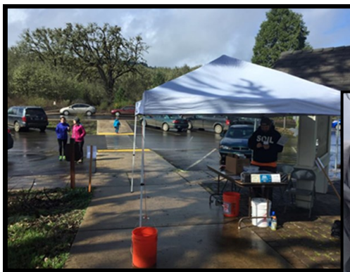
Bird Photos : Teri Engbring