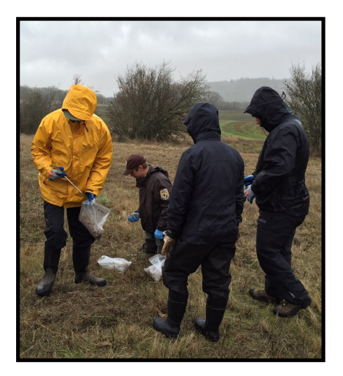
Bulb planting at Baskett Slough Refuge

Lastly, thank you all for being part of our organization and for your help. Without you, this organization could not endure. Your membership and donations have provided our organization with the funds to assist our refuges in many activities, such as protecting threatened and endangered species, removal of invasive species and encouraging our children to enjoy the outdoors. Thank you again.