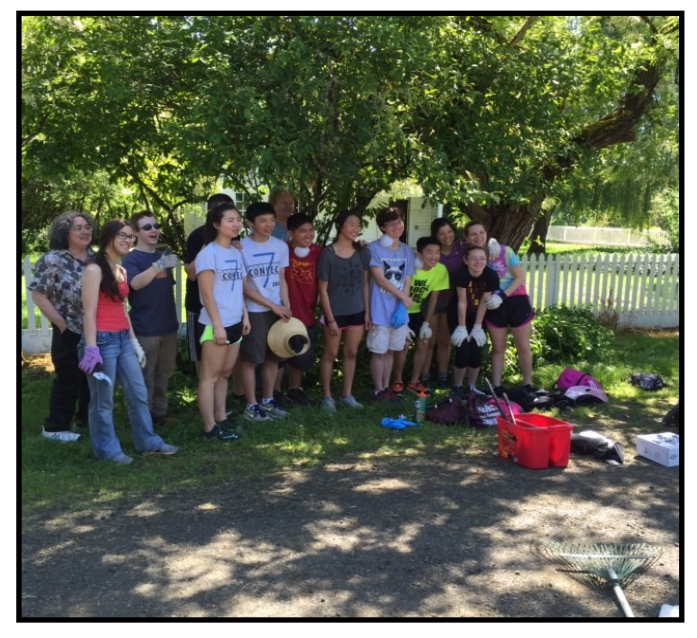
Some of the volunteers at the William L. Finley clean-up event on May 7th

Cleaning up an overgrown native garden