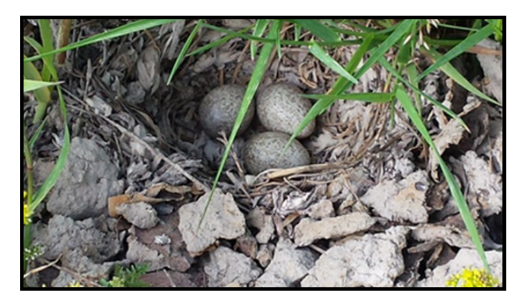
Streaked horned lark nest (M. Monroe)